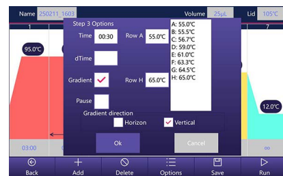
Quick and Easy Programming