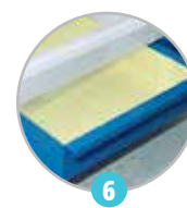
6 Absorbent mat in the Containment sump