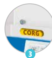
3 Control window