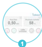
1 Touch screen