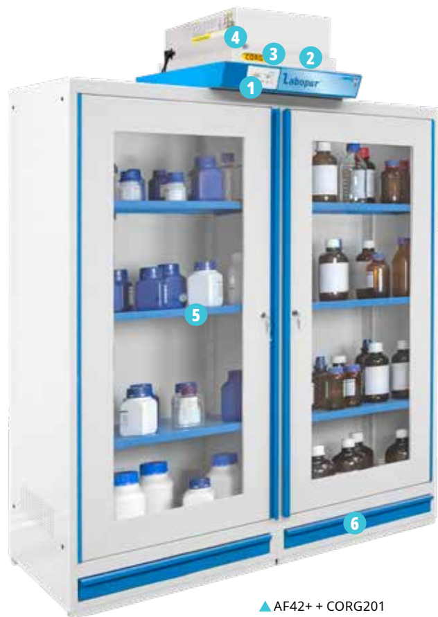
▲ AF42+ + CORG201