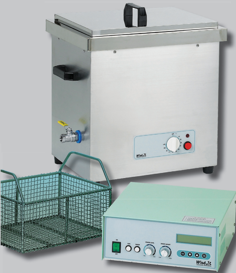
WUC-N47H with basket (not included) and remote controller

digital, with lid and external controller, 30 l - 74 l, HF frequency 40 kHz