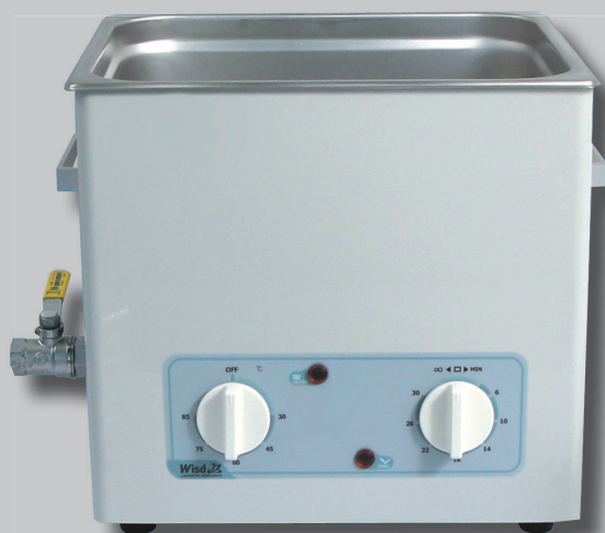
WUC-A06H with lid and valve