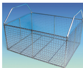
Stainless steel wire baskets for ultrasonic cleaner WUC-N

Note: no basket included, please order separately.